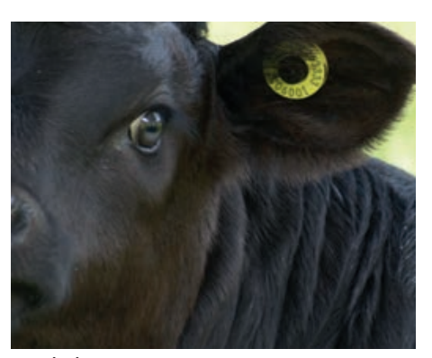
Cattle button tag