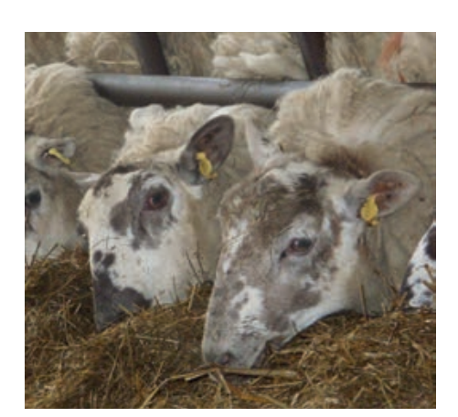
Sheep with EID tags

Immediate access to animal data can help with management decisions.