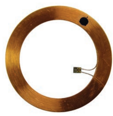
Coil from EID cattle tag